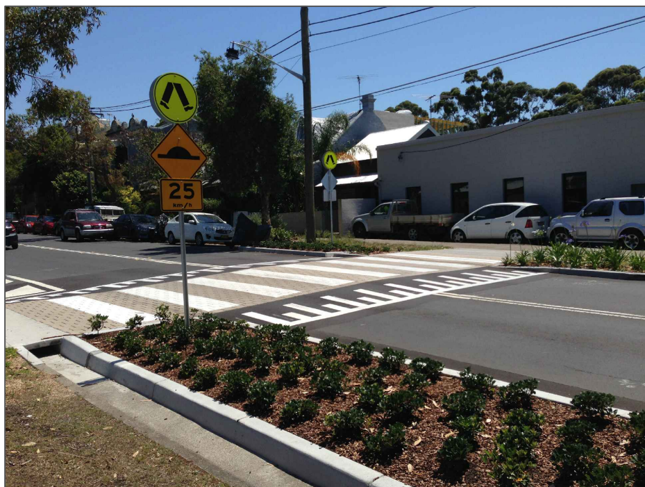
TYPICAL RAISED PEDESTRIAN CROSSING